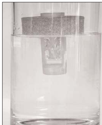
Figure 1: Dialysis with MEGA FlexTube

IMPORTANT: To perform dialysis with a range of 3 - 10ml use IBI MEGA 10ml FlexTubes. To perform dialysis with a range of 10 - 15ml use IBI MEGA 15ml FlexTubes. To perform dialysis with a range of 15 - 20ml use IBI MEGA 20ml FlexTubes.