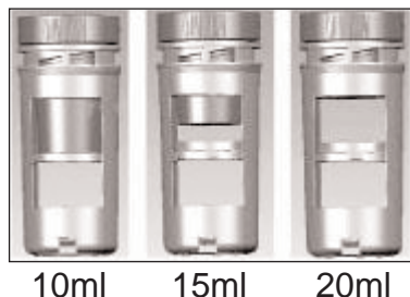
Figure 2: 3 sizes of MEGA FlexTubes 10, 15, 20ml

IMPORTANT: Sample volume should be in the range of 3 - 20ml. If smaller volumes (3-5ml) are used, load the samples close to the inner membrane.