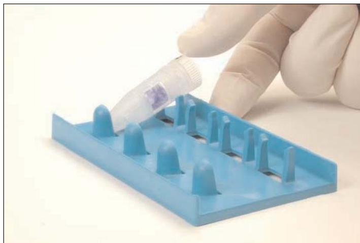
Figure 3: Insertion of the IBI FlexTube in the provided supporting tray. The arrow on the cap should be pointing upwards.

IMPORTANT: The two membranes of the IBI Flextube(s) must be in perpendicular to the electric field to permit the electric current to pass through the tube.