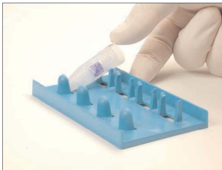
Figure 1: Insertion of the IBI FlexTube in the provided supporting tray. The arrow on the cap should be pointing upwards.

IMPORTANT: The arrow on the cap should be pointing face up. The two membranes of the IBI FlexTube must be in perpendicular to the electric field to permit the electric current to pass through the tube.