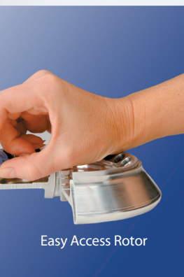
Easy Access Rotor

The rotor is designed to hold all standard 1.5/2.0ml tubes (both conical bottom and skirted), and the snap on lid offers space for micro-filter filters that fit into the tops of the tubes. Adapters are available for processing smaller tubes, and our exclusive StripSpin Adapter fits onto the top of the rotor for centrifuging standard 8-tube PCR strips.